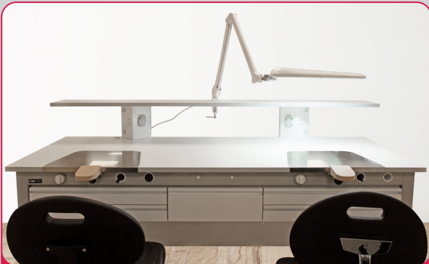
Lamp view to the right.