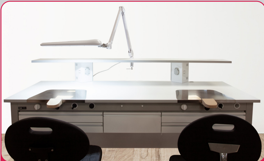
Lamp view to the left.