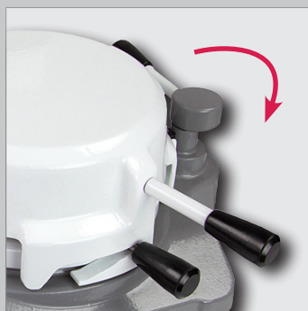
6. Pressurization lock