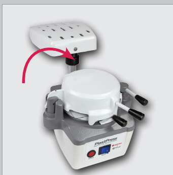
5. Pressurization position