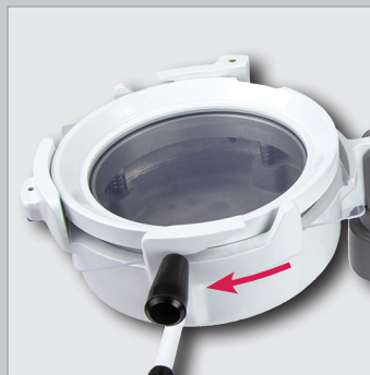
3. Sheet lock