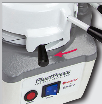
7. Sheet release