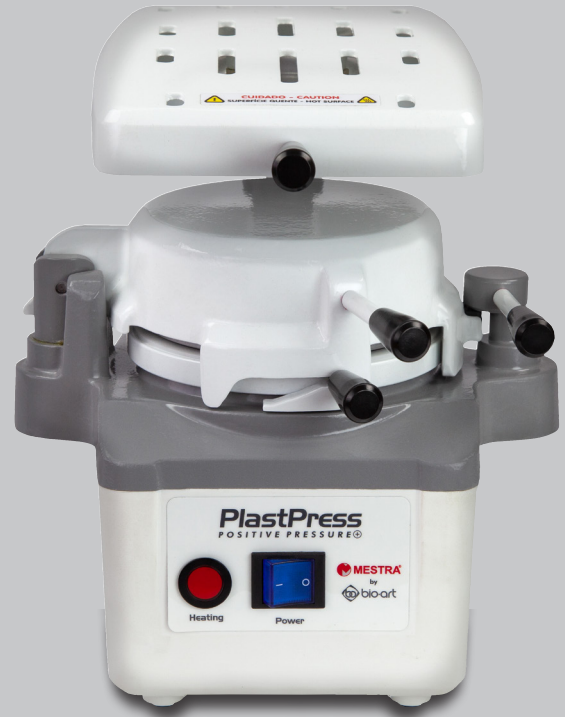
PlastPress pressure former REF. 080544