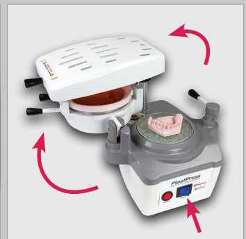
4. Heating position