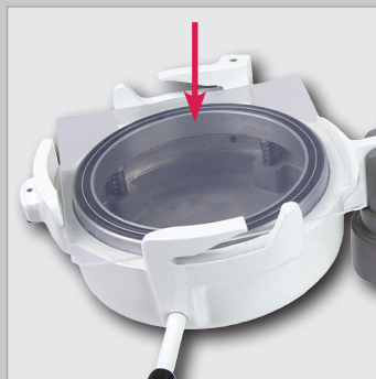
2. Positioning the sheet