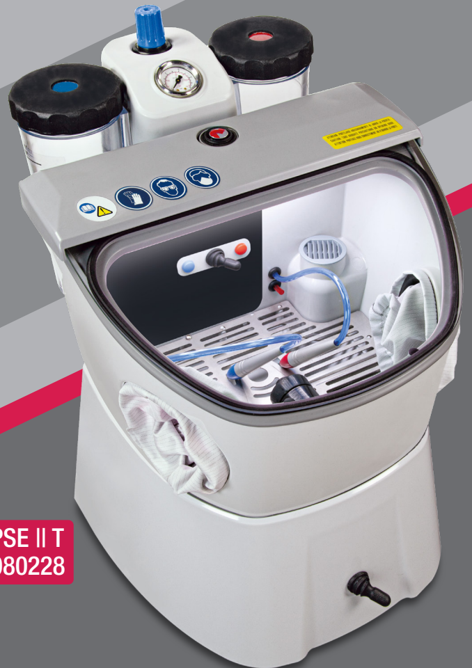
ECLIPSE II T Ref. 080228