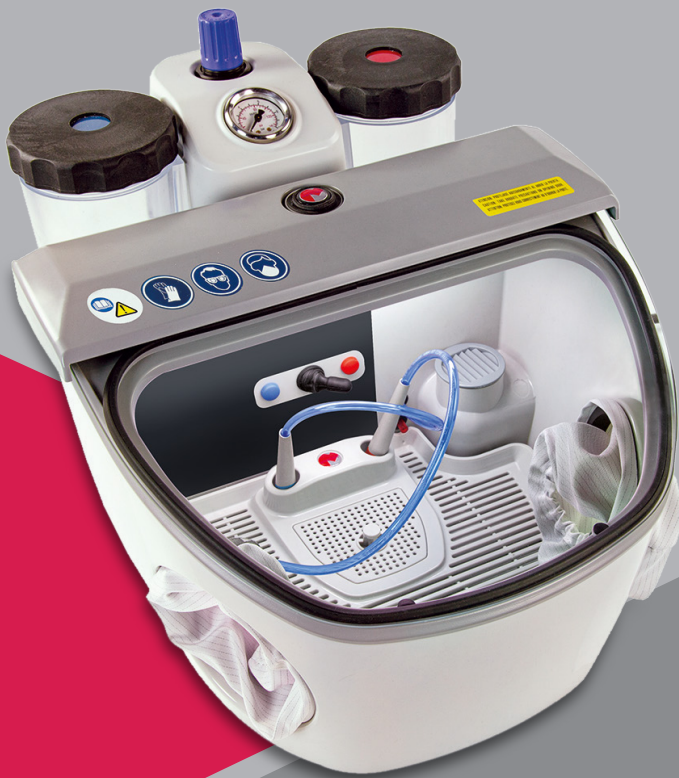
ECLIPSE II Ref. 080220